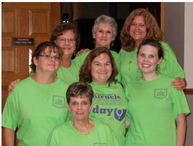
Above: Staff members from the City of Fayetteville’s administrative offices go casual for a good cause

On September 14, 2011, many employees at UAMS in Little Rock and employees of the City of Fayetteville broke out of their routine wardrobe and wore jeans and a t-shirt to work! In fact, people all over the nation took part in this casual work day. The event was organized as a fundraiser by the Children’s Miracle Network. The idea behind the event was simple. Businesses across the country purchased ‘Miracle Jeans Day’ t-shirts and then resold them to employees for a minimum donation of $5. Employees were allowed to “dress down” during midweek when they would normally “dress up” or wear a uniform. All proceeds were donated to the Arkansas Children’s Hospital in Little Rock. From what we hear, many UAMS and City employees enjoyed this fundraiser very much. We would like to thank everyone who participated in making this a very successful event!